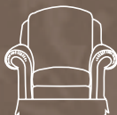
Grand Wing Chair