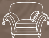
High Arm Chair