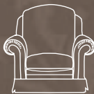
Grand Wing Chair