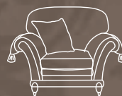
High Arm Chair